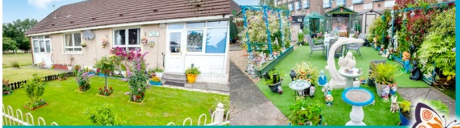
Best Individual Garden: Bridie Convey