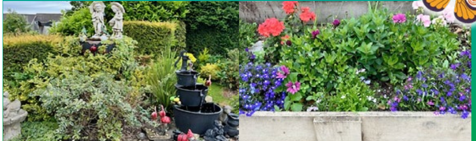
Best Communal Garden: Pirnie Place Retirement Housing