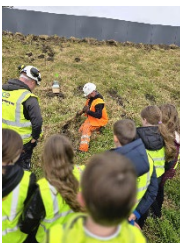
Fig 2. Enabling works – Drainage