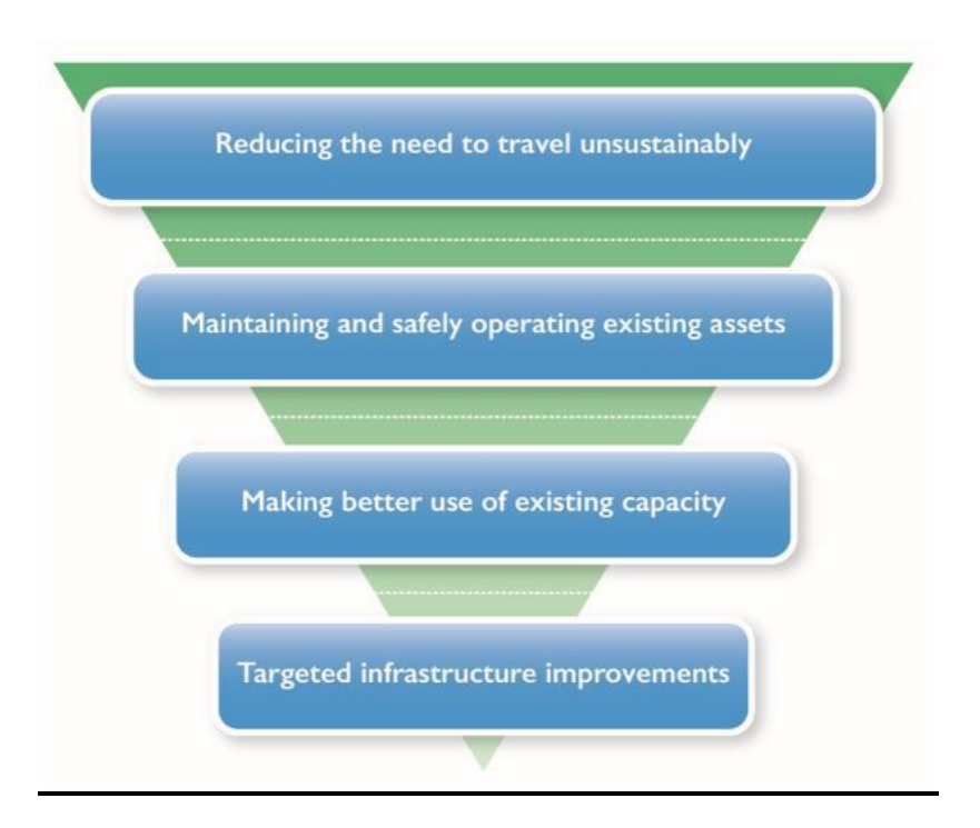
Figure 2 Sustainable Investment Hierarchy

4.19 The Sustainable Investment Hierarchy in NTS2 and NPF4 has the purpose of guiding investment to promote sustainable travel. This is shown in Figure 2 below: