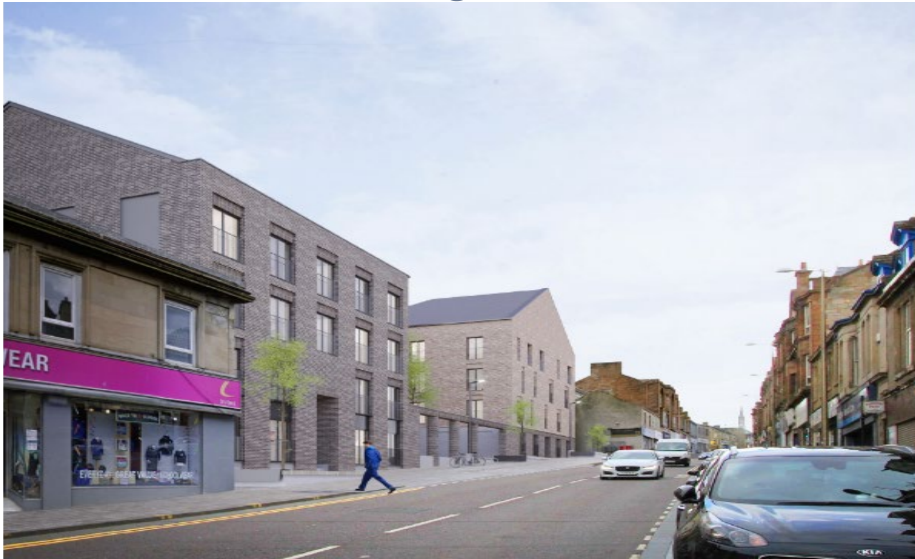
Image: Proposed residential flatted development on Main Street (former Anvil Block)