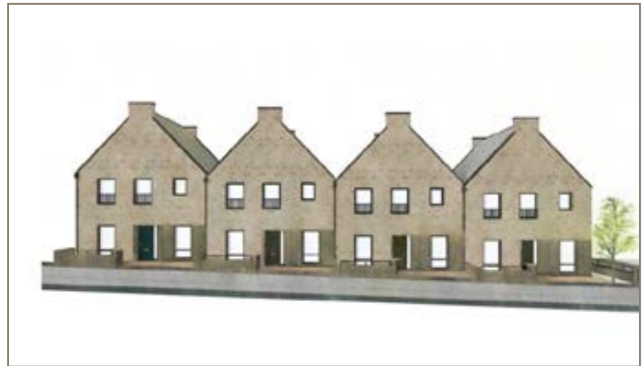
Images: The top two images are exemplars of modern residential flatted development, the bottom two images are sketch proposals for the replacement for the Anvill Block on Main Street.