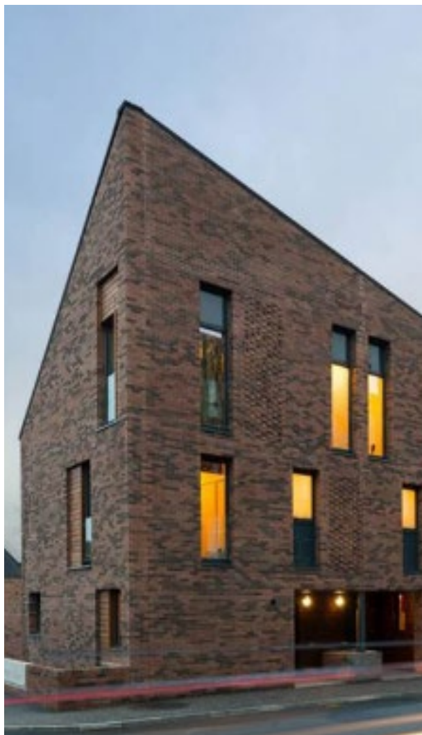
Image: Former Orr's Department Store

Encouraging more people to live in town centres is a key policy aspiration for the Council underpinning priorities around sustainability, net zero, inclusion and wellbeing. More people living in town centres means more support for local businesses. It means keeping bus routes active, a safer place thanks to passive policing and greater local interest in the town centre environment. These all make a town more attractive to people living here.